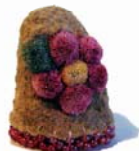
Leather Thimble from the N.W.T. with tufted moose hair decorations.